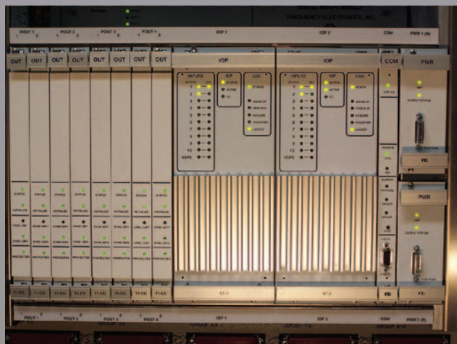
US5G—The New BITS