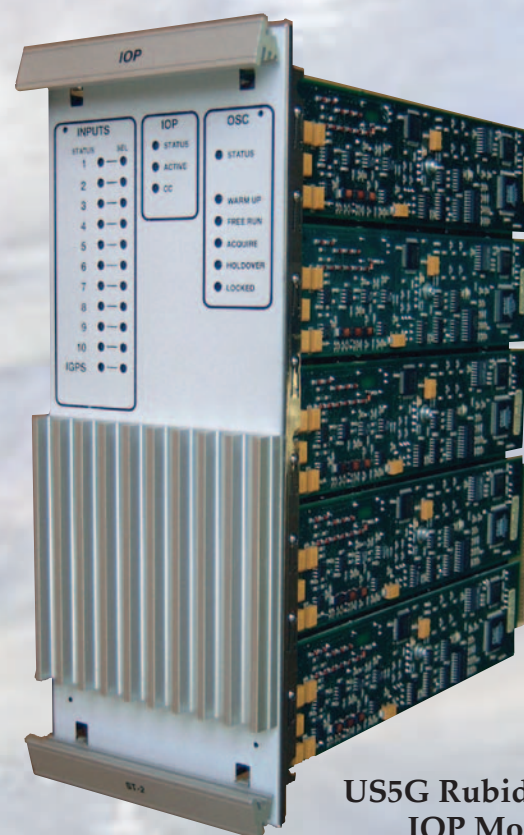
US5G Rubidium IOP Module